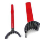
TIMING GEAR SETTING TOOL