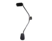
GEAR CHANGE LEVER