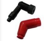
CAP SPARK PLUG