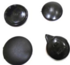
CAP RUBBER CHAIN COVER