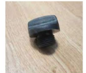
CAP OIL FILTER